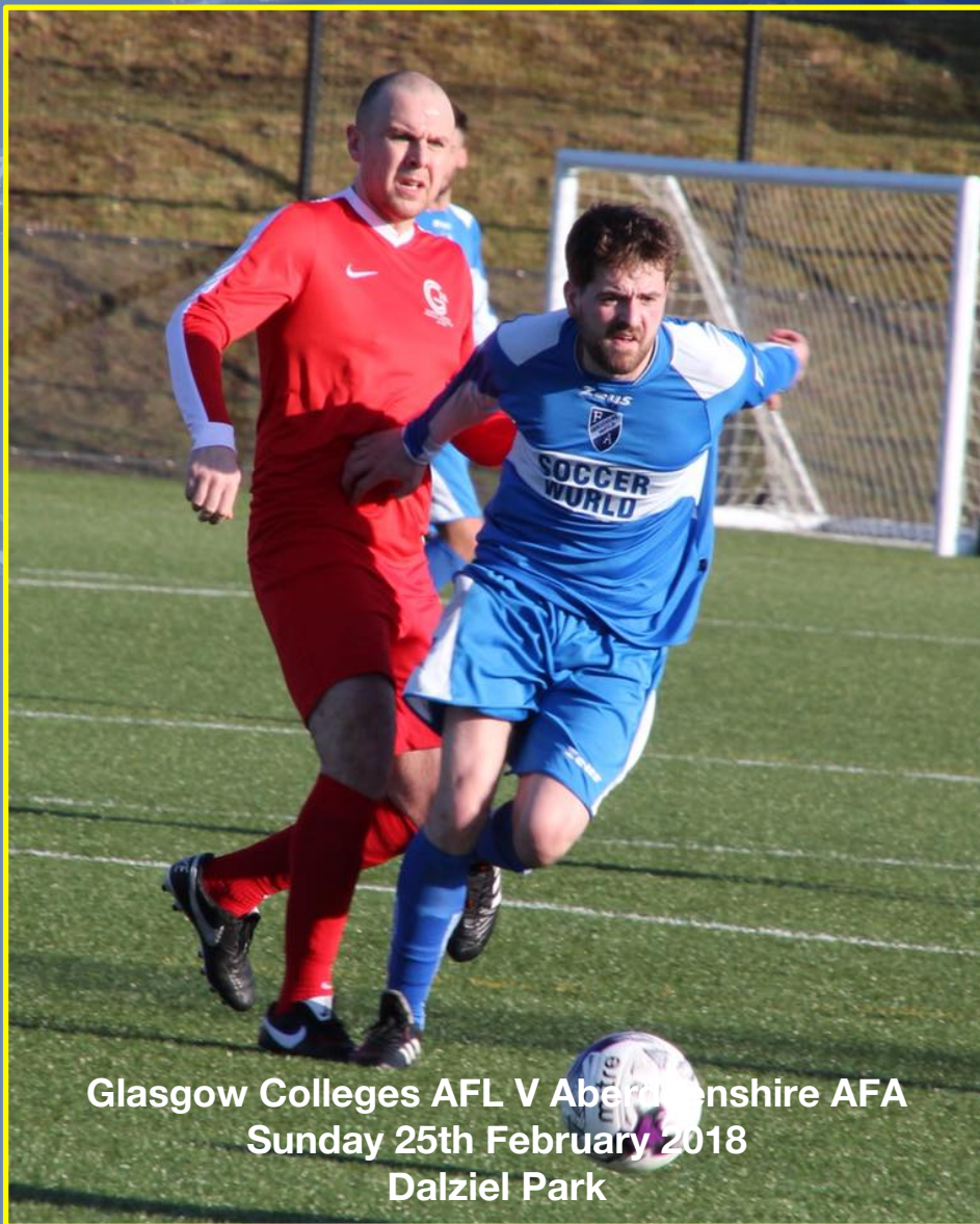
Glasgow Colleges AFL V Aberdeenshire AFA Sunday 25th February 2018 Dalziel Park