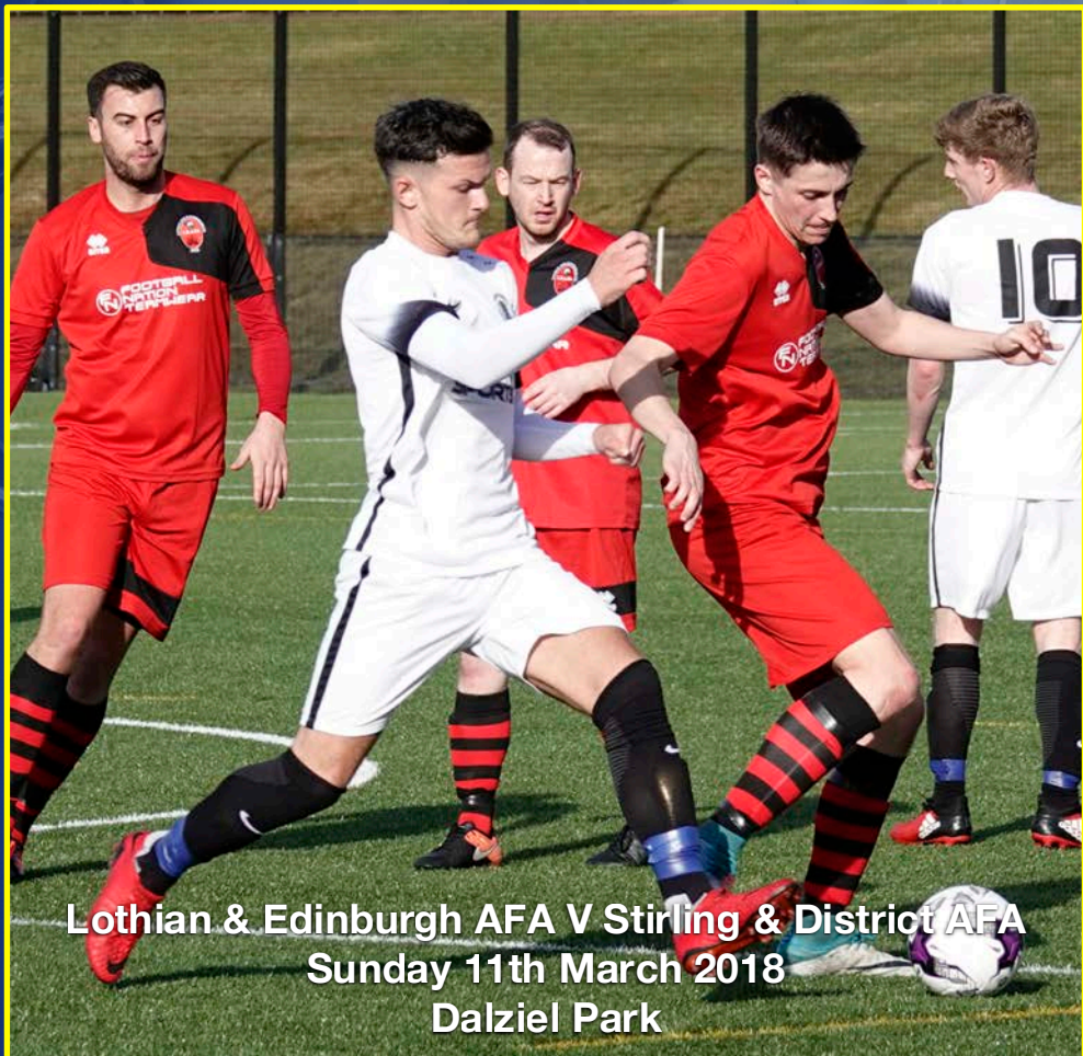
Lothian & Edinburgh AFA V Stirling & District AFA Sunday 11th March 2018 Dalziel Park